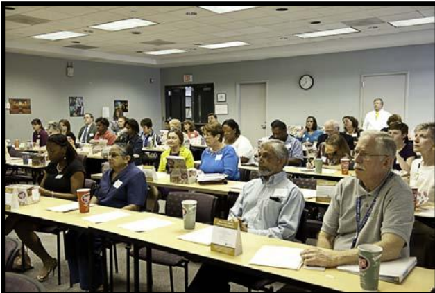
Some of the attendees of the day's EIFFE event.