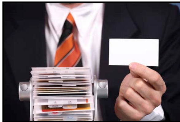
Are you being paid to make client referrals? If so, be careful not to run afoul of the state's Investment Advisers Act.

As in most states, in North Carolina, any individual who directly or indirectly solicits any client for or refers any client to an investment adviser for a fee or some other benefit is known as a "solicitor," in investment adviser terminology. The solicitor is subject to the state registration requirements for an "investment adviser representative." For the arrangement to be deemed legal in North Carolina, the investment adviser (which can be either an individual or a company) must be registered with the North Carolina Secretary of State or the federal Securities and Exchange Commission. In addition, the solicitor cannot have a history of certain disciplinary actions; there must be a written agreement between the solicitor and the investment adviser; and the fee paid to the solicitor must be adequately described in the written agreement. The written agreement must describe the solicitor's activities, his/her compensation, and acknowledge that the solicitor agrees to perform his/her duties consistently with the investment adviser's instructions.